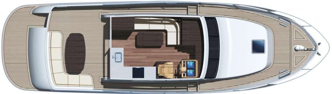
Standard floor plan